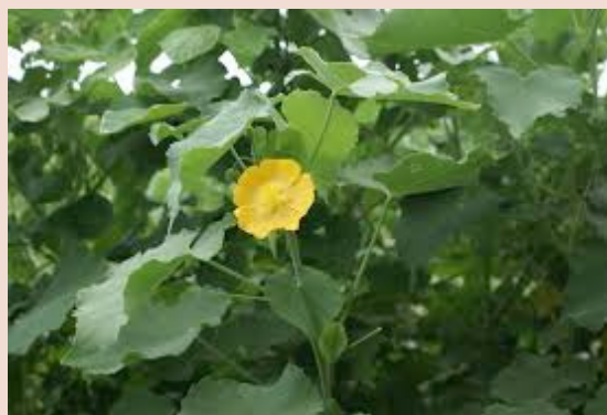
Figure 1: Abutilon indicum Linn