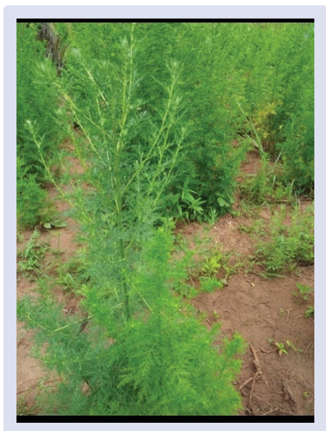
Figure 1: Artemisia annua L. whole plant.