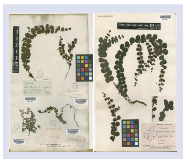
Figure 2: Herbarium records of A.serpyllifolia (KEW Botanical Gardens)

SYNONYM ERIATHERA NEESIANA Wight and Arn. ex Nees species