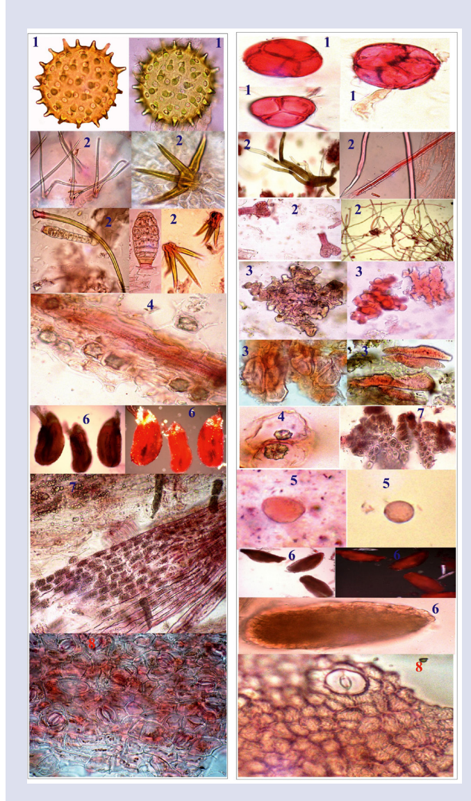
Figure 3: Powder Microscopic Characters of Dried Flowers of Hibiscus rosa-sinensis and Rhododendron arboreum 1, Pollen grains; 2, Trichome; 3, Stone cells and sclereids; 4, Crystals; 5, Oil globules; 6, Ovule; 7, Starch grains; 8, Stomata.

crude drug and also in powdered formulation in which it is one of the ingredients.