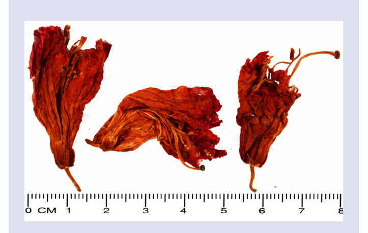
Figure 2: Dried Flowers of Rhododendron arboretum .

arboreum. Thus, the confusion between this two flowers exists in literature and as well as in the market. In this adulteration, scarcity in availability of genuine drug and similar looking plenty available adulterant is the intension.