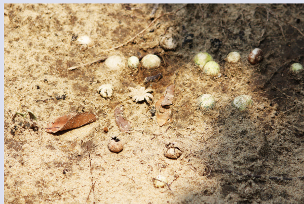
Figure 1: Astraeus hygrometricus in wild condition.

Polysaccharides, polysaccharide-protein complexes and proteins are the high-molecular-weight (HMW) components obtained from mushrooms, recognized for their biological activities. 36 Investigations carried on A. hygrometricus showed the presence of different bioactive molecules like lectins, polysaccharides and protein complexes. Yagi et al (2000) first reported the presence of lectins from A. hygrometricus . 37 Later Pramanik and Islam (2000) characterized and introduced the first polysaccharide from the aqueous extract of A. hygrometricus containing D-galactose, D-glucose and D-galacturonic acid in the ratio of 1.9:0.9:1 (Figure 2a). 29 In later years Maiti et al (2008) extracted a water-soluble polysaccharide (Figure 2b) from an alkaline extract of the fruits of A. hygrometricus containing D-mannose, D-glucose, and L-fucose in a molar ratio of 1:2:1. 38 Similarly another research group isolated water soluble fraction from this macrofungus which on fractionation through chromatography