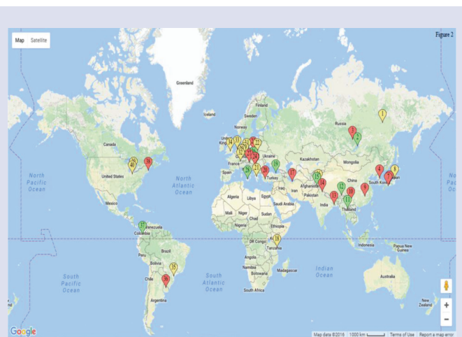
Figure 2: An overview of places in world where wild specimens of Laetiporus sulphureus have been used for research. The map has been generated automatically with help of www.mapcustomizer.com where yellow, green and red colours designate report of bioavailability, nutritional value and medicinal attributes of the fungus. Name of the places are as follows: 1. Jakutsk, Siberia, Russia 2. Lake Baikal, Russia 3. Slyudyansk and Irkutsk regions, Russia 4. Mt. Odae, Gangwon Province, Korea 5. Ashiu Experimental Forest of Kyoto University, Japan 6. Ashibidani, Shiga prefecture, Japan 7. Tokushima prefecture, Japan 8. Mt. Gassan, Yamagata Prefecture, Japan 9. FenYi, JiangXi Province, China 10. Ailao Mountain, Yunnan province, China 11. Chiang Rai, Thailand 12. Arunachal Pradesh, India 13. Coastal area of West Bengal, India 14. Dehradun, India 15. Rawalakot and Dhirkot, Azad Jammu and Kashmir 16. Gilgit–Baltistan, Pakistan 17. Mazandaran, Iran 18. Oyster Bay and Mtoni mangrove forests along Indian Ocean in Dar es Salaam, Tanzania 19. Giresun–Bulancak, Black Sea Region, Turkey 20. Denizli, Turkey 21. Greece 22. Lublin, Poland 23. South Poland 24. Belgrade, Serbia 25. Jojkićev branch of Danube River, near Pančevo, Northern Serbia 26. Hungarian Middle–Mountain 27. Slovenska Bistrica, Slovenia 28. Sicily, Italy 29. Tübingen, Germany 30. Happerger, Germany 31. Saxony, Germany 32. Switzerland 33. Baarn, Netherlands 34. Royal Holloway College, United Kingdom 35. Curitiba, State of Parana, Brazil 36. Uruguay 37. Andina region, Colombia 38. MIT, USA 39. Ann Arbor, MI, USA 40. North–eastern Ohio

During 1940s, the nutritional value of mushrooms became highlighted under impact of war time food shortages. Since then, scientists are investigating on dietary constituents of edible macrofungi in search of alter-