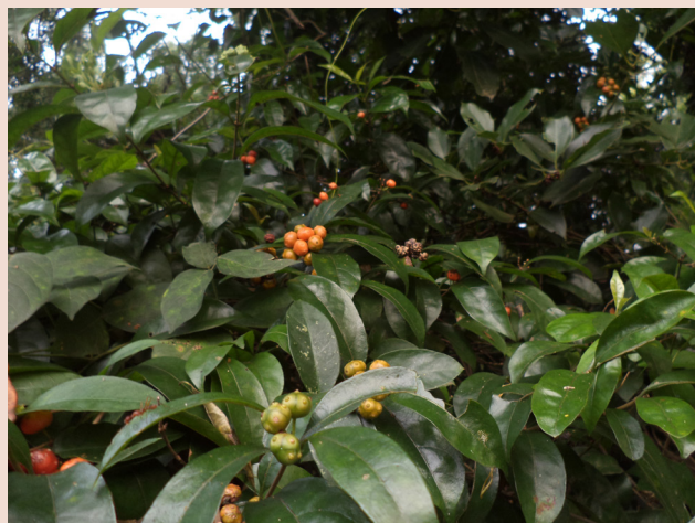
Figure 1: Habit of Gynochthodes umbellata