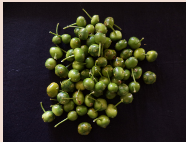
Figure 2: Young fruit of Gynochthodes umbellata

No. 42 filter paper and the filtrate was used to determine the mineral content using Atomic Absorption Spectroscopy (AAS). 17 Four macro elements, Magnesium (Mg), Sodium (Na), Calcium (Ca), Potassium (K) and six micro elements like, Iron (Fe), Copper (Cu), Manganese (Mn), Zinc (Zn), Lead (Pb), Cadmium (Cd) were quantified in ripened fruit of G. umbellata .