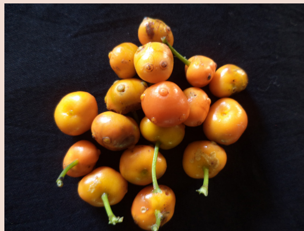
Figure 3: Ripened fruit of Gynochthodes umbellata

Carbohydrates are one of the most important components in many fruits. The total carbohydrate content in fresh fruits of G. umbellata was