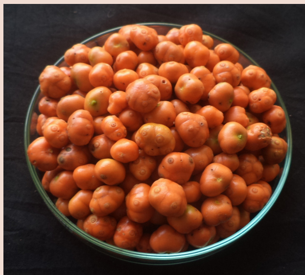
Figure 4: Ripened fruit harvested for analysis