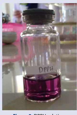
Figure 2: DPPH solution.