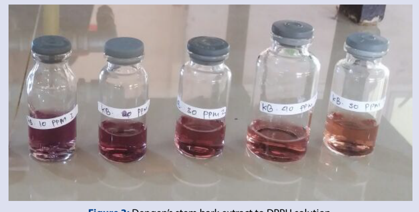
Figure 3: Dengen's stem bark extract to DPPH solution.