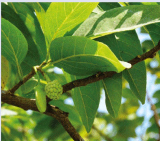
Figure 1: Twigs of A. squamosa showing fruit and leaf. 13