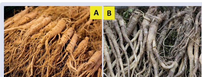
Figure 1. Similarity of the roots of Panax ginseng with Platycodon grandiflorum (A) Panax ginseng root (B) Platycodon grandiflorum.

laxatives, diuretics, anxiolytics, and antidepressants. 41 Anorectics, such as fenfluramine, sibutramine, fenproporex, diethylpropion, clobenzorex, rimonabant, phentermine, and mazindol, are the most common class of synthetic ingredients found in weight-loss HMs. 42 These anorectics in addition to lorcaserin (a selective agonist of serotonin receptors that helps control hunger and reduce caloric intake) were found to be the main ingredients of a herbal weight-loss medicine that was sold under the name of "Lose Quickly" in France. It has been demonstrated that large doses of lorcaserin can result in anxiety, hallucinations, agitations, and convulsions. 43 Benzodiazepines are often used as a masking agent with anorectics containing products to mask (alleviate) the adverse side effects of anorectics that include headaches, anxiety, irritability, and mood swings. 44-46