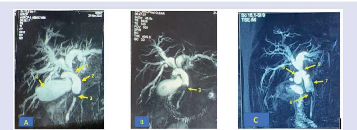
Figure 1. Preoperative MRCP (A-B) and Post cholecystectomy MRCP (C). (A&B): Narrowing CHD pushed by dilated cystic duct (A1), CBD dilatation on the first assumption (A2), the stone located at mid CBD on the first assumption (A3, B3), Gall bladder (A4). (C): The narrowing part of CHD (C5), remnant of dilated cystic duct (C6), part of non dilated CHD is bent by the dilated cystic duct (C7) and stone located at distal cystic duct (C8). CBD Common Bile Duct, CHD Common Hepatic Duct, MRCP Magnetic Resonance-Cholangio-Pancreaticography.

Note: CBD Common Bile Duct, GB Gall Bladder, CBF Cholecystobiliary Fistula, CEF Cholecystoenteric Fistula, MS Mirizzi Syndrome